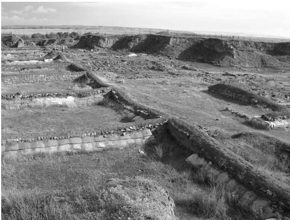
Fig. 17.5a–c. Citadel Mound: (a, top) 2005, view east across Terrace Building to Citadel Gate (modern scaffolding), Tumulus MM, and other tumuli; (b) 2006, view west across Terrace Building; (c, opposite page) 2006, John Marston investigating melic growing on a north-facing slope near the Citadel Gate.