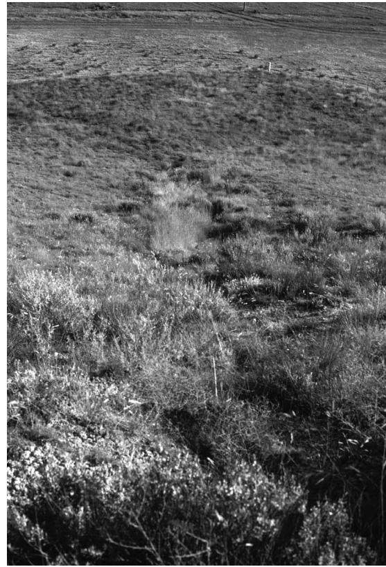
Fig. 17.2a-c. Looking down Erosion Channel 3: (a, above left) 1997, mud brick; (b, above right) 1999, with post 12 in background, seeded annuals visible; (c, right) 2002, bare surface largely gone.

themselves even on the steepest part of the south slope. There are also differences from one year to the next: after the particularly harsh winter and spring of 2004, for example, the prolific annual wall barley ( Hordeum murinum ) was greatly reduced for several growing seasons.