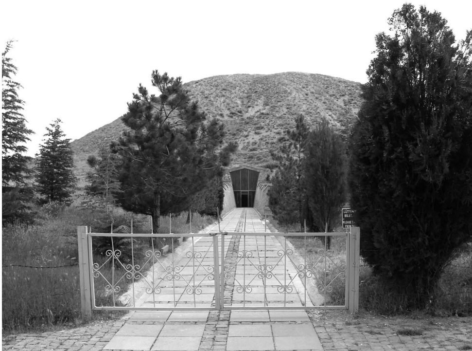
Fig. 17.3c (above), d (below)