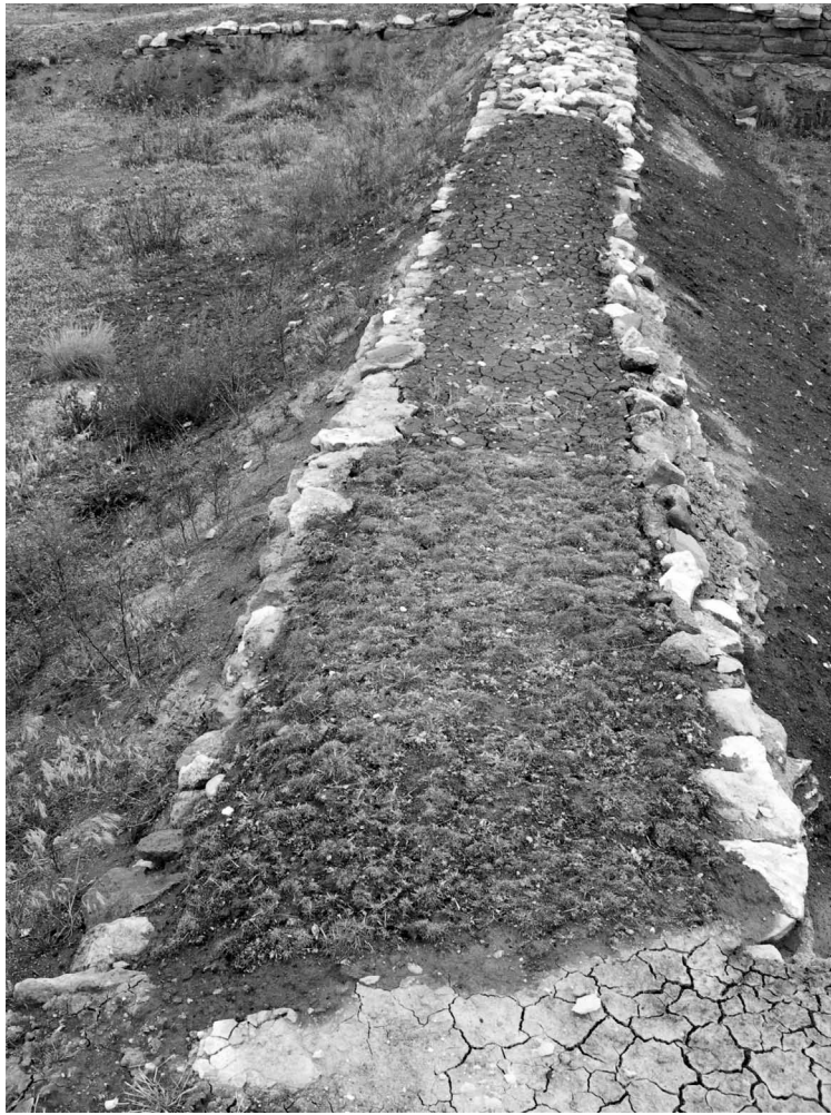
Fig. 17.6. Terrace Building 2 experiment, 2007. Poa clumps in foreground, seeded and mudballed in middle ground, “no treatment” in background.

tervention would improve the aesthetics of the site. Tall perennial grasses could be planted in small clumps on the collapsed profiles, and even watered, until they establish themselves. These plants are non-invasive, unlike annuals such as Descurainia sophia , orache, Asperugo procumbens , Bromus tectorum ; and in the unlikely event that they did spread to the wall stubs, it would be easy to control their growth. If these plants were massed, they would also effectively direct the visitor’s gaze toward key areas of the site. Several types of plants are ideal for this purpose: melic and sheep fescue grow well on north-facing slopes, and feathergrass ( Stipa arabica ) has been spreading